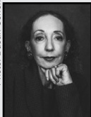
JOYCE CAROL OATES My Life as a Rat Hazards of Time Travel The Gravedigger's Daughter