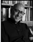
ALEX ESPINOZA Still Water Saints The Five Acts of Diego Leon Cruising