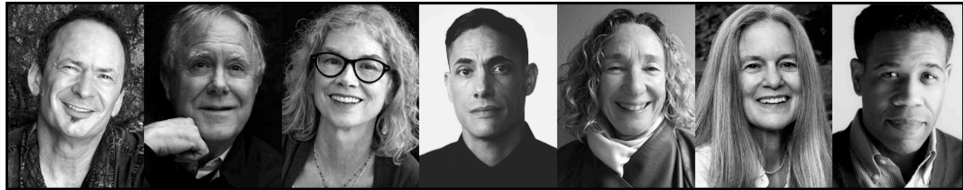
FORREST GANDER • ROBERT HASS • BRENDA HILLMAN