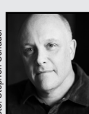
GREGORY SPATZ Inukshuk Half as Happy What Could Be Saved