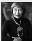
AMY TAN The Joy Luck Club The Valley of Amazement Where the Past Begins