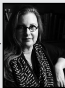
JANET FITCH Chimes of a Lost Cathedral Revolution of Marina M. Paint it Black