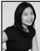
VANESSA HUA A River of Stars Deceit and Other Possibilities