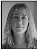
EDAN LEPUCKI California Woman No. 17