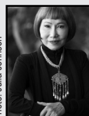
AMY TAN The Joy Luck Club The Valley of Amazement Where the Past Begins