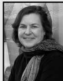
KAREN JOY FOWLER We Are All Completely Beside Ourselves Wit's End Black Glass