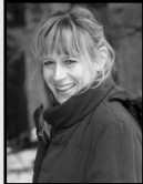
EDIE MEIDAV Kingdom of the Young Lola, California Crawl Space