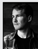
GABRIEL TALLENT My Absolute Darling

BOOKS WILL BE AVAILABLE FOR SALE AND SIGNING AFTER THE READINGS.