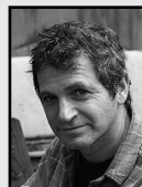
PETER ORNER Love and Shame and Love Esther Stories Am I Alone Here?