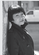
AMY TAN The Valley of Amazement The Joy Luck Club The Bonesetter's Daughter Saving Fish from Drowning