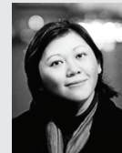
YIYUN LI Kinder Than Solitude Gold Boy, Emerald Girl The Vagrants