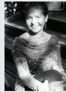
ELIZABETH ROSNER Electric City Gravity The Speed of Light